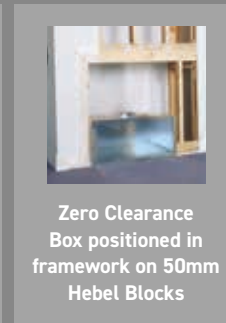
Zero Clearance Box positioned in framework on 50mm Hebel Blocks